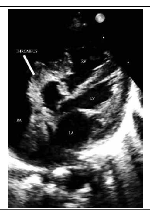
Figure 2. Modified Apical Four-Chamber View, Showing the Thrombus Extending From the RV into the Pulmonary Artery (PA)

The neonate was started on intravenous heparin but succumbed to the massive venous thrombosis 3 days later. Critically ill neonates are at a particularly high risk of venous thrombosis because of inflammation, disseminated intravascular coagulation, abnormal liver function, and fluctuations in cardiac output. Peripheral catheters have a lower incidence of thrombosis compared to centrally placed catheters; the highest incidence of thromboembolism is seen with femoral lines. Though heparin infusion at a dose of 0.5 IU/kg/h is recommended to maintain line patency, this does not reduce the risk of